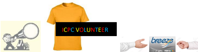
(ICPC Volunteers will be in gold shirts)

When you arrive at the airport and have all your luggage, follow the instructions to get to the MARTA station. Most airport employees can direct you if you don't see the signs.